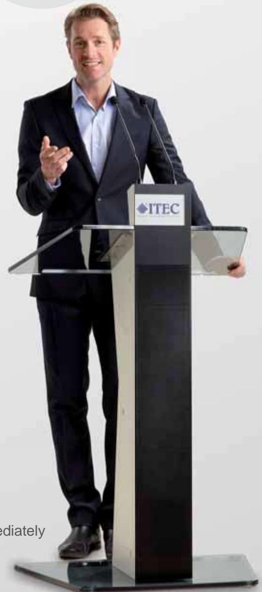
Ready to use immediately