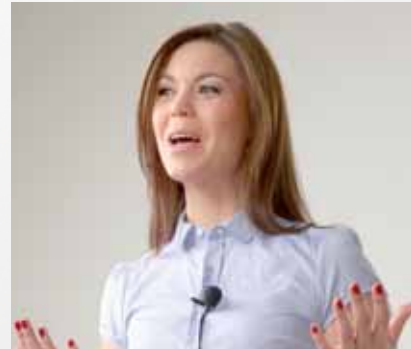
Clip-on microphone Discreet, comfortable to wear