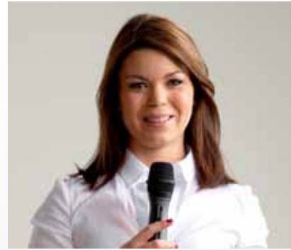
Hand-held microphone: Universal use, easy handling