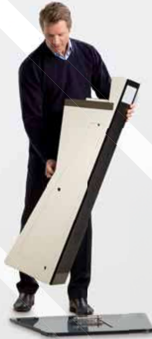
Set up in no time