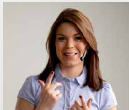
Headset: The professional solution for top clarity