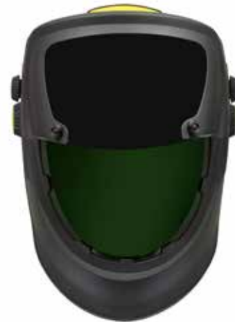
Large inner grinding visor.