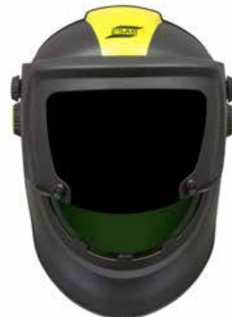
G30 Front Closed