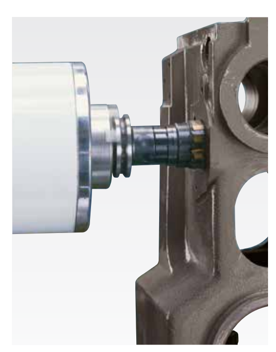
Table rotates for multi-sided machining